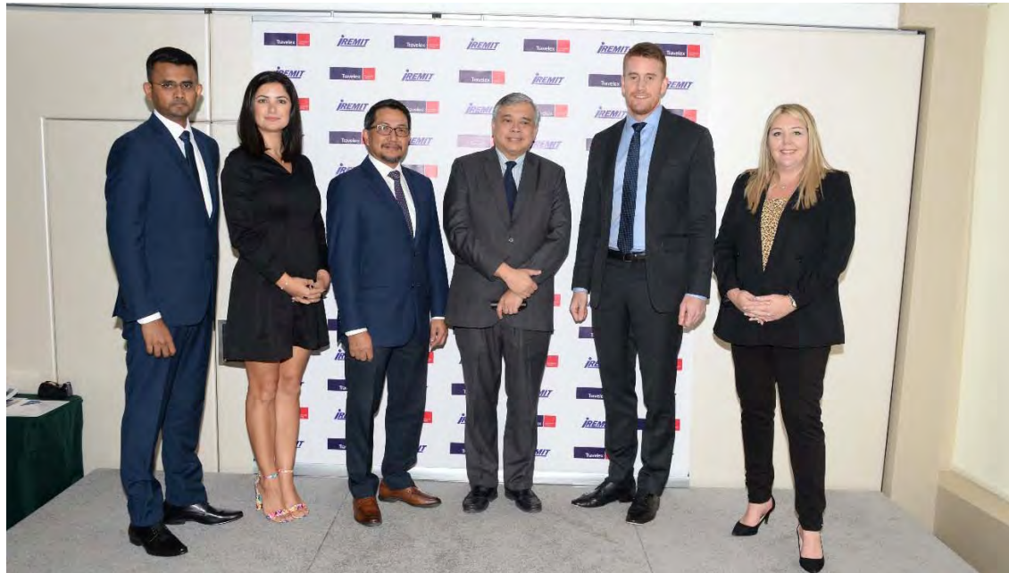
OFFICIAL LAUNCH OF THE I-REMIT – TRAVELEX PARTNERSHIP HELD ON AUGUST 26, 2018 AT THE WYNDHAM GRAND BAHRAIN BAY, MANAMA